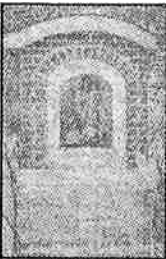
Dewey Drive, Torun

Follow N. 2nd Street, which becomes Second Drive, north out of Stevens Point for 2-3 miles as it passes under Hwy 51 and follows parallel to the highway to an intersection with Woodview Drive. Notice the recently restored cross - a tradition in the Wojcik family. Continue north on Second Drive to turn left on W. Casimir Road to proceed to St. Casimir's Church. Established in 1871, it was the second Polish Catholic church in this area. The present brick Victorian building was constructed in 1913.